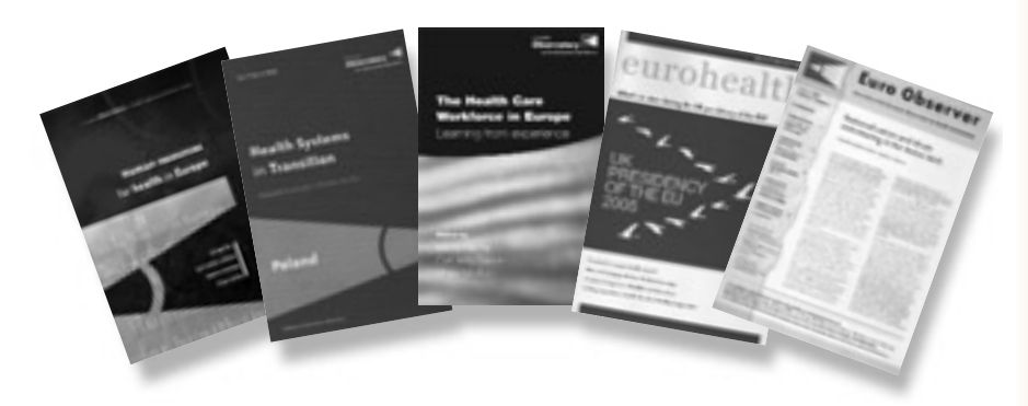
The European Observatory on Health Systems and Policiesproduces a wide range of analytical work on health systems and policies. Its publishing programme includes: